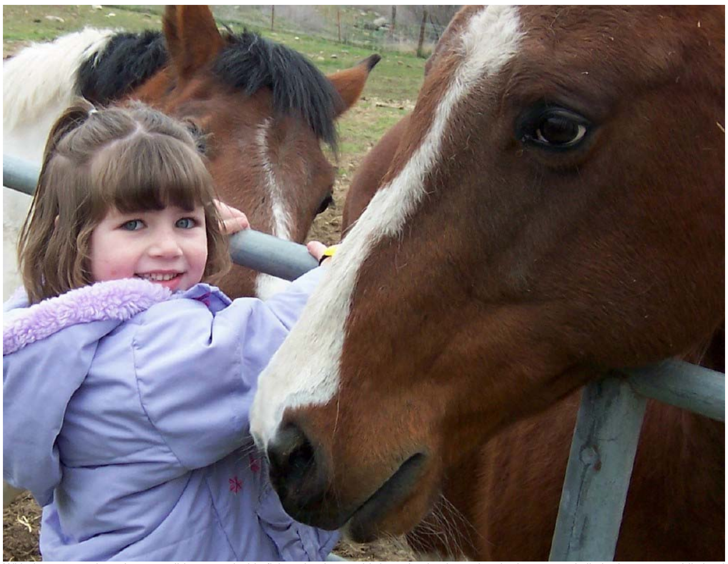
With the opportunity to harvest wild trout and whitefish, upland game birds and animals, and mule deer severely limited on most public land in Idaho, what has happened to our grandchildren's hunting and fishing heritage?

In March 2006, 16 of 34 Idaho Senators voted against giving Idaho voters the chance to decide whether hunting, fishing and trapping should be a Constitutional right - or simply limited privileges granted by the state. Several who voted against SJR 106, said there is no present