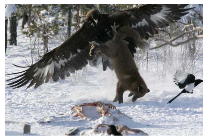
Many species like this golden eagle, red fox and magpie share the role of both scavenger and predator.

As the preservationists point out, killing is what all predators and most scavengers do to survive. But for some of the predators I have observed over time, the pursuit and "savaging" the prey appears to be an exhilarating sport as well as the means of surviving.